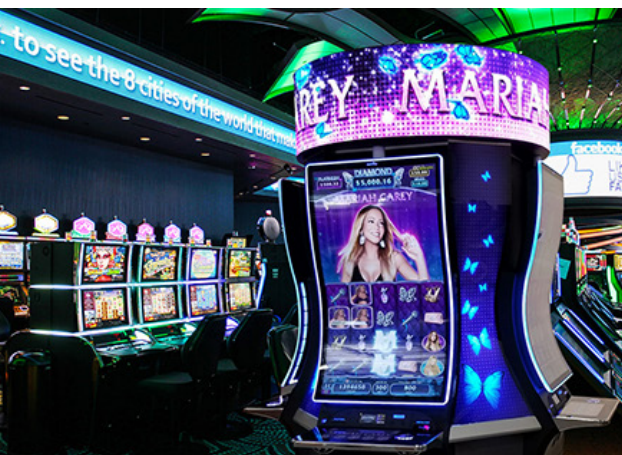
Nixel Series™ technology in action

The curved Nixel Series™ display above the entrance to the bingo room is 1.5 feet tall and 56 feet wide, equipped with a 4mm pixel pitch to engage guests wandering elsewhere in the casino. The display inside the bingo room is 9.45 feet tall and 15.75 feet wide with a 2.5mm pixel pitch. Each of these displays are optimized to provide audiences with the best possible viewing experience.